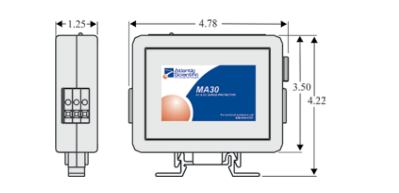
Figure 1 Dimensions